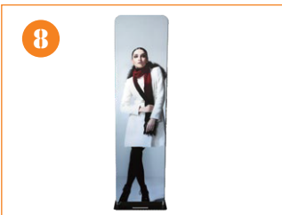
8. Completed Snello frame with graphic.