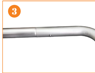
3. Arrange and assemble the frame by connecting the tubes together.