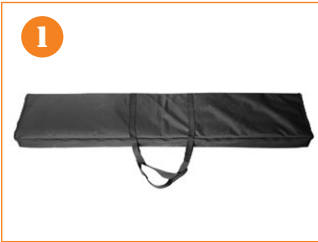
1. Snello black padded bag.