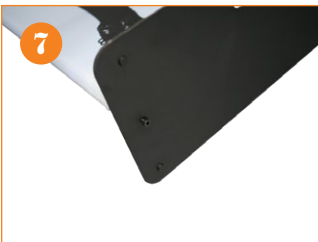
7. Attach base with provided screws.