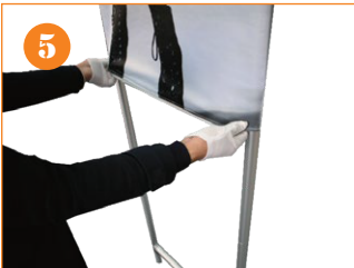
5. To install the graphic, slide the graphic from the top of the frame towards the bottom.