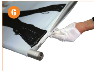
6. Zip the bottom of the graphic.