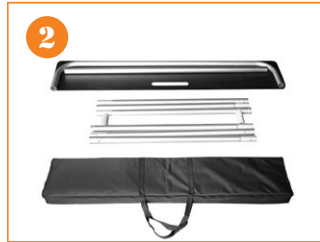
2. Take out the parts of the frame from the bag.